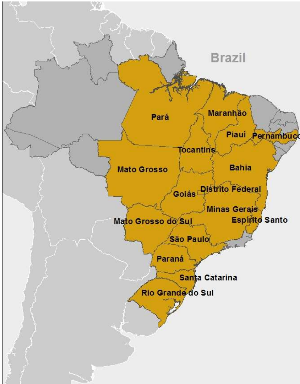
Figure 3: Map of Brazil States from which ADM is sourcing soy

For Brazil, we have also confirmed all states from which ADM sources soy as shown in the below map: