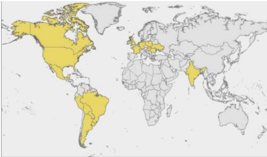
Figure 2: The darkened areas represent countries where ADM has facilities that source, refine, or process soy products 2 .

ADM has carried out a global assessment of all facilities where soy is sourced, stored, processed or traded. The map of the world below shows all countries in which ADM has facilities that source, refine, or process soy products.